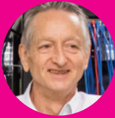
Geoffrey Hinton Chief Scientific Advisor